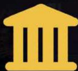
Industry talk halls